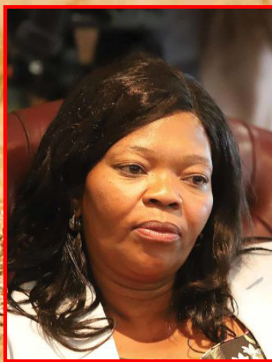
Minister of Environment, Natural Resources Conservation and Tourism Philda Kereng